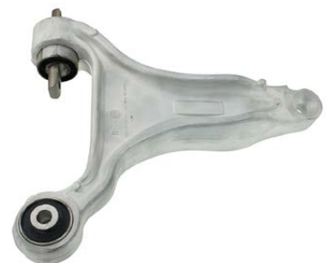
XC70 MEYLE no. 516 050 0024/HD [Short no. MCA0669HD] 516 050 0025/HD [Short no. MCA0670HD]