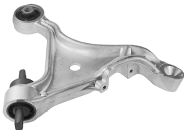
S80 MEYLE no. 516 050 0007/HD [Short no. MCA0657HD] 516 050 0008/HD [Short no. MCA0658HD]